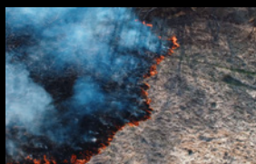
Fire and Rescue