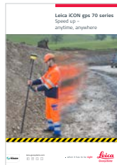
Leica iCON gps 70 Series Brochure

Illustrations, descriptions and technical data are not binding. All rights reserved. Printed in Switzerland - Copyright Leica Geosystems AG, Heerbrugg, Switzerland, 2020. 818196en - 01.21