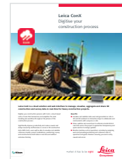
Leica ConX Flyer