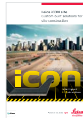
Leica iCON site Brochure