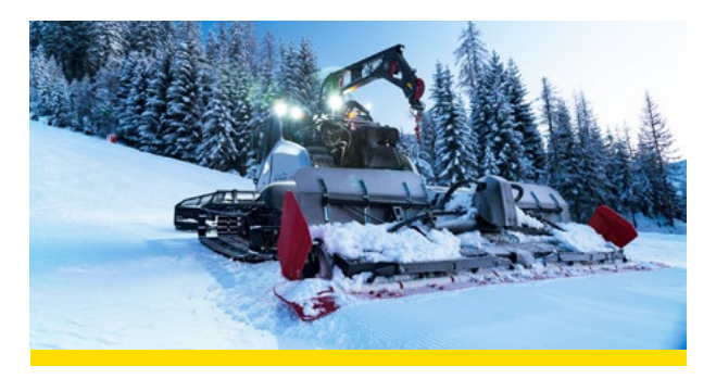
The Leica iCON alpine snow management solution makes slope preparation according to a 3D reference model a walk in the snow-park!