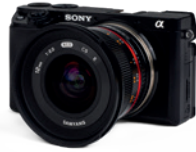
Oblique Sony a6100 3D mapping camera