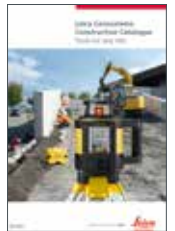
Construction Tools Catalogue