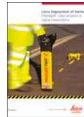
Leica Digicat xf-Series Brochure