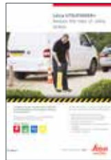
Leica UTILIFINDER+ Flyer

Illustrations, descriptions and technical data are not binding. All rights reserved. Printed in Switzerland – Copyright Leica Geosystems AG, Heerbrugg, Switzerland, 2015. 842508en - 12.15 - INT