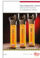
Leica Digicat i-Series Brochure