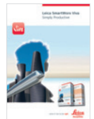
Leica Smartwrx Viva Software brochure