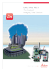
Leica Viva TS15 Product brochure