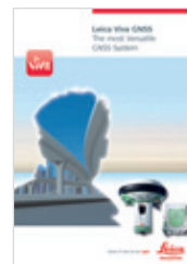
Leica Viva GNSS Product brochure