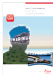
Leica Viva Imaging Product brochure