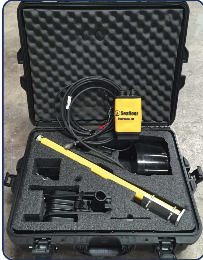
Rugged shipping case