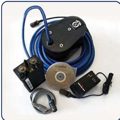
Sonarmite™ DFX Echosounder