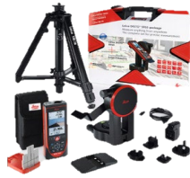
S910** P2P Package