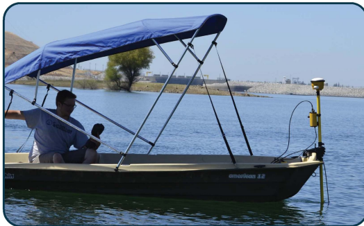
HydroLite-TM Mounted to jon boat bow