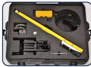
Rugged Shipping Case