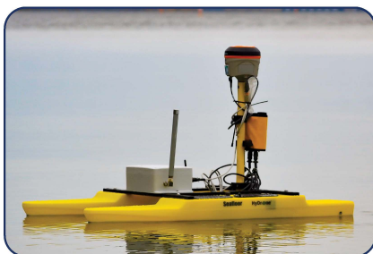
Unit can be integrated into remote / autonomous vessels