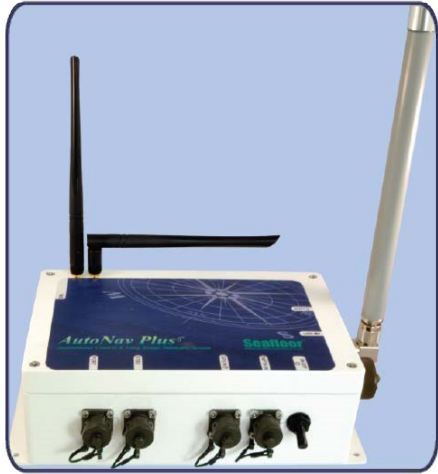
AutoNav Plus™ system fits small to large USVs