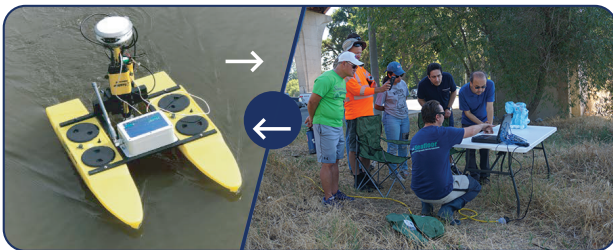
HyDrone™ USV equipped with AutoNav Plus™ / Onshore computer setup