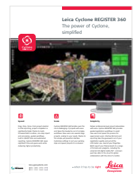
Leica Cyclone REGISTER 360