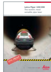
Leica Piper 100/200 Brochure