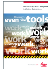
PROTECT by Leica Geosystems Brochure