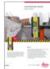
Leica Rod Eye Series Data sheet