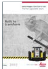
Leica Rugby CLA/CLH/CLI Brochure

Illustrations, descriptions and technical data are not binding. All rights reserved. Printed in Switzerland - Copyright Leica Geosystems AG, Heerbrugg, Switzerland, 2018. 812719en - 08.18